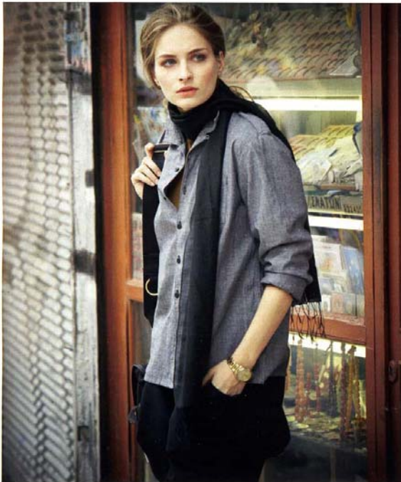
Cotton shirt, £115, MHL by Margaret Howell; cotton sweater (worn underneath), £45, and silk trousers, £59, both COS; linen scarf, £45, Tommy Hilfinger; cotton bag, £170, YMC; gold-plated watch, £145, Rotary