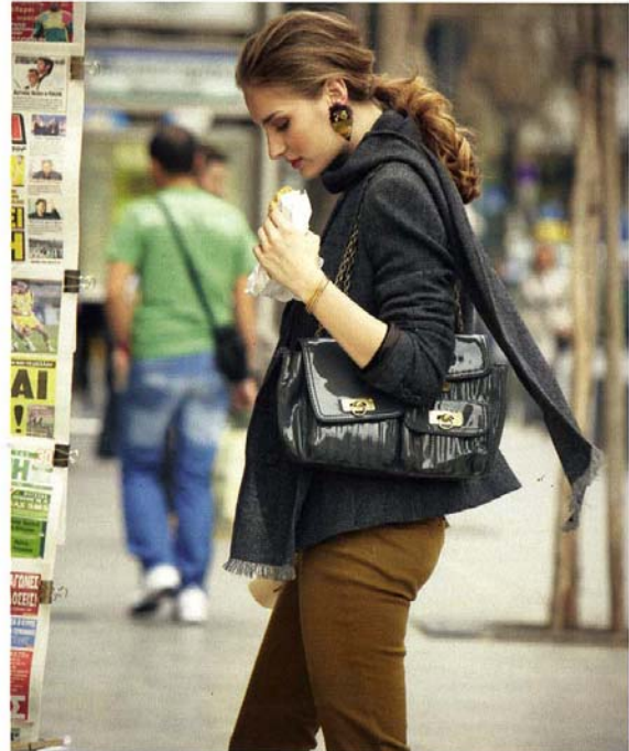
Wool-mix jacket with scarf, from a selection, Nicole Farhi; cotton trousers, £119, Bruuns Bazaar; brass and bead earrings, £150, Lizzie Fortunato at Kabiri; 18ct gold bangles, from a selection, Tous; patent leather bag, £280, Paul & Joe