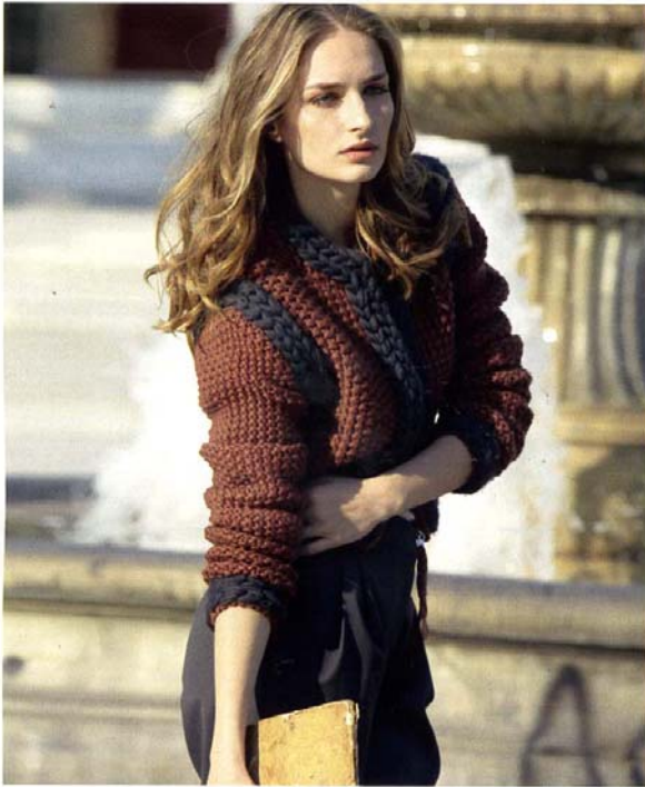
Silk cardigan, £110, By Malene Birger; cotton-mix trousers, £95, Comptoir des Cottonniers