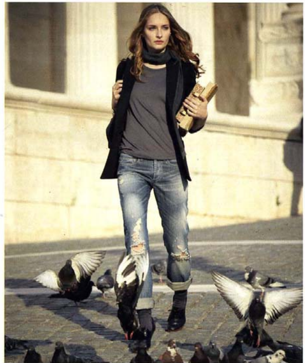
Wool blazer, £370, Paul & Joe; cotton top, £13, American Apparel; denim jeans, £160, Twin-Set; cotton socks, £10 for three pairs, Marks & Spencer; leather shoes, £58, Office; wool-mix scarf, from a selection, Nicole Farhi