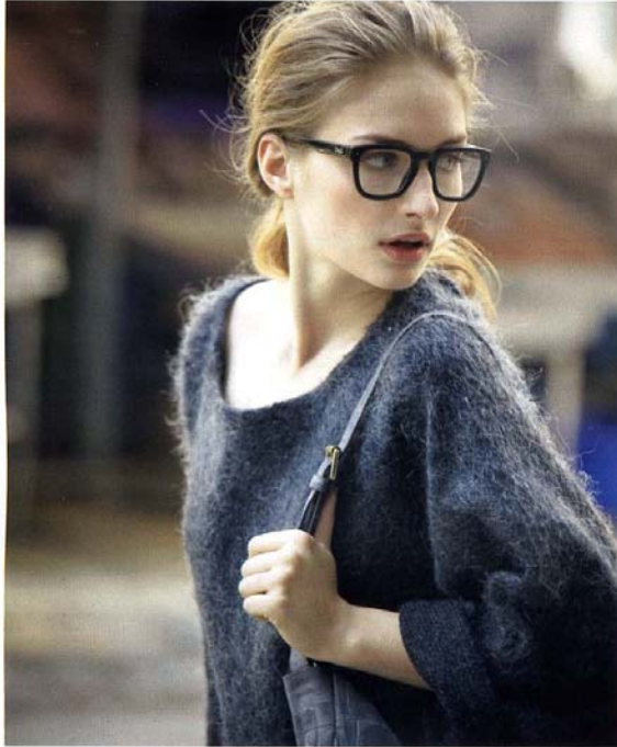
Mohair dress, £300, Natascha Stolle; glasses, £119, D&G at David Clulow; suede bag, £395, Mulberry