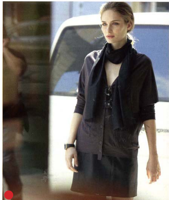
Viscose-mix cardigan, about £80, Hope; leather skirt, £289, Paul by Paul Smith; scarf, as before; sunglasses, from £130, Fabris Lane; stainless steel watch, £385, Breil